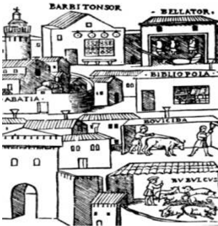
Figure 1: Mnemonic system with abbey (Johannes Romberch: Congestorium Artificiose Memorie , Venice 1533)