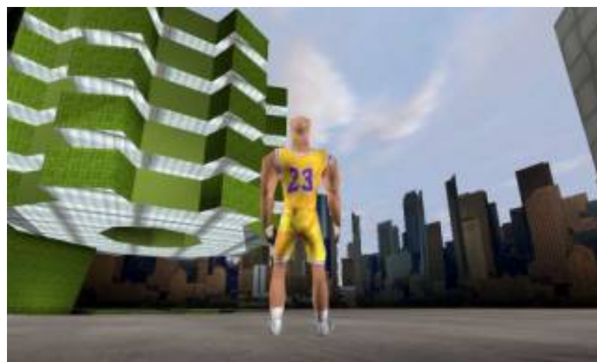
Figure 3: First person user in front of the Virtual Technical Museum ( Virtueller Wissensraum by fuchs-eckermann)

Even though these questions might have been approached at a rather pragmatic level there is a semantic question lying underneath. If we are going to map semantic fields ( semantische Felder ) into fancy rooms, the signified ( Signifikate ) into topics, and the signifiers ( Signifikanten ) into 3D-objects or sound objects, does the game we are about to be immersed with still correspond to the semiotic structure we started with? If we suppose that we had a clear concept of a semantic structure, e.g. in the form of a Quillian model [5] or a Katz and Fodor structure [6], could we rediscover the model or structure in our game then? In other words: is there an isomorphism of the semantic structure of the object under investigation and the spatial structure of the "level"? [2] We don't think so.