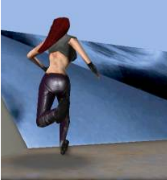
Figure 5: Running Avatar ( Virtueller Wissensraum by fuchs-eckermann)

knowledge represented by different objects, this means that you are taken over by a spontaneous idea or an abrupt change of mind. Translocators on the other hand are devices allowing the player to go from one point to another deliberately and quickly. In some way translocators can be compared to the rhetorical formula "Let's change the topic."