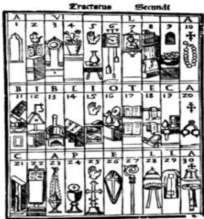
Figure 2: Items used within the mnemonic system of Romberch

Obviously the urban structure of the mnemonic system helped in keeping a sense of orientation amongst the rather abstract items under investigation. That is why urban metaphors and architectural metaphors were so popular with medieval mnemotechniques.