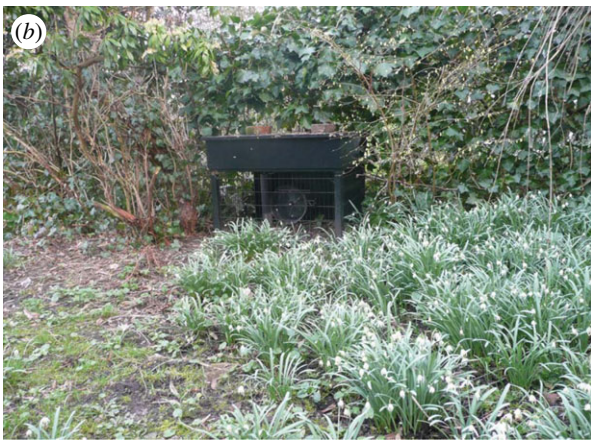
Figure 1. Photographs of the experimental set-up. The set-up is shown in situ in the (a) dunes and (b) urban area. Note that even though the set-up resembles a cage, any animal that is not larger than a rat can freely enter and exit the recording area, food tray and wheel.

to identify the species responsible for movement of the wheel. Over a period of over 3 years, we have analysed more than 12 000 video fragments in which wheel movement was detected, out of more than 200 000 recordings made when animals visited the recording site. Video recordings were analysed by trained observers in order to determine the species of the animal in the wheel. Wheel movement was detected automatically using a small magnet attached to the wheel and a stationary magnosensor. Wheel running was scored when the sensor was activated.